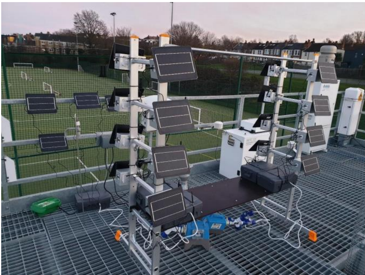
Figure 1 Co-location testing at Honor Oak Park.

The basic calibration and scaling process applied to Breathe London nodes is described below and in the first quarterly report (available at https://www.breathelondon.org/network-reports ). In December 2021 we implemented phase 2 of our calibration process with the introduction of dynamic network scaling. To develop this method, we needed a long time series of sensor data incorporating a wide range of meteorological conditions.